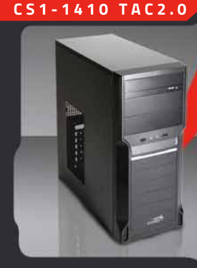
BCP450-0C PSU BCP450-OC INCLUDED

Sentey case CS1-1410 TAC 2.0 is not only fitted with the best interior in the market, but also provides a top quality finish.