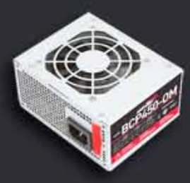
PSU BCP450-OM INCLUDED