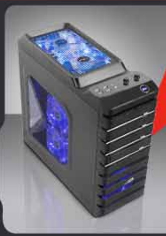
ABADDOM II GS - 6 0 7 0

This mid- tower case brings an innovating design with mesh front panel, manufactured with rolled steel, black interior and exterior, and the internal structure offers maximum performance and management. Adding to the versatility of the front port for connecting USB 3.0 full speed and Peripherals last generation with 7 coolers including achieve optimal internal temperature in the case.