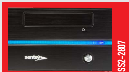
Power Button ODD bay