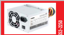
Embedded PSU BCP450-OS