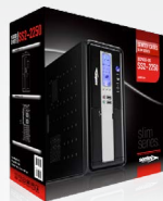
New packaging design SS2-2250