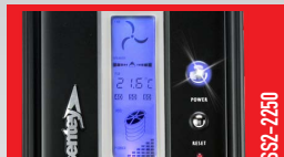
Front Panel LCD