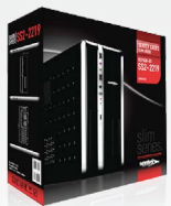
New packaging design SS2-2219