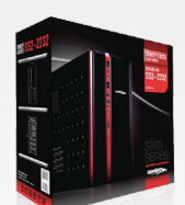
New packaging design SS2-2232