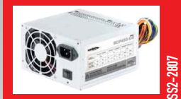
Embedded PSU BCP450-OS