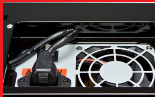
Power Supply Connection