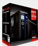
New packaging design SS2-2220