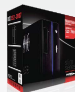
New packaging design SS2-2807