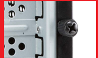
Assembly hand screw