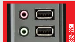
2 USB 2.0 front ports+ Audio & Mic