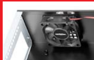
Top cooler 60 mm