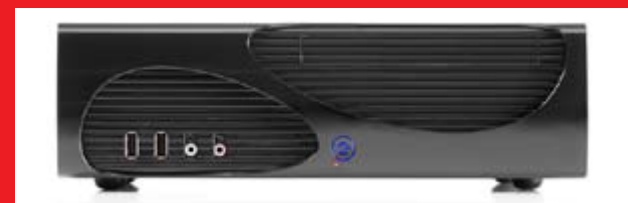
Horizontal position including optional rubber feet