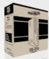
Packaging Design SS5-2514