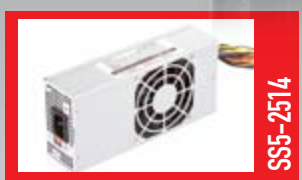
PSU included BC0450-01