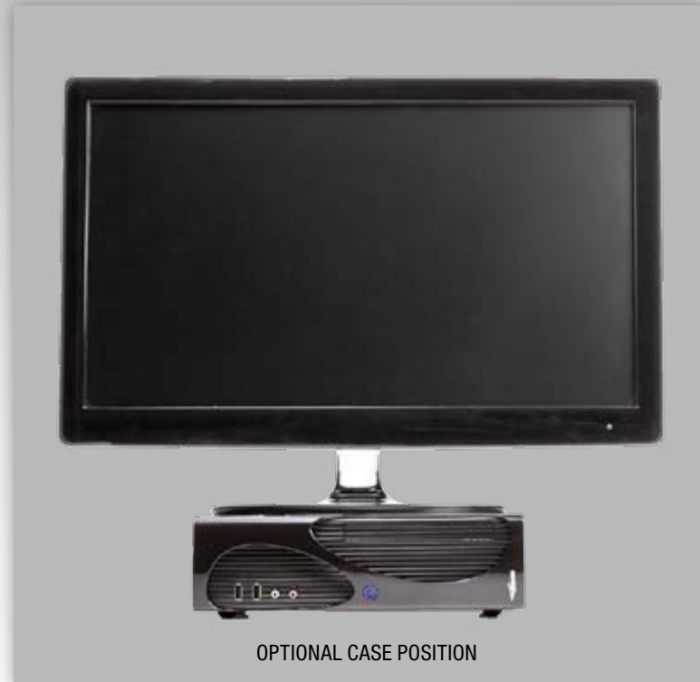
OPTIONAL CASE POSITION