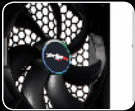
Back fan 12cm