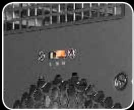
Embedded fan cooler controlled by switch