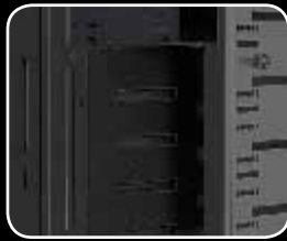
Anti-vibration sponge for hdd