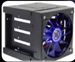
Rack for 4 disk hdd