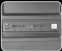
P/W & Reset SW/E-Sata/USB/AUDIO.