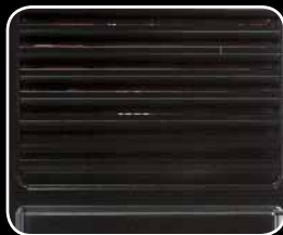
Top "airflow" ventilation