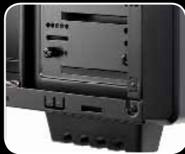
Anti-slide rubber feet