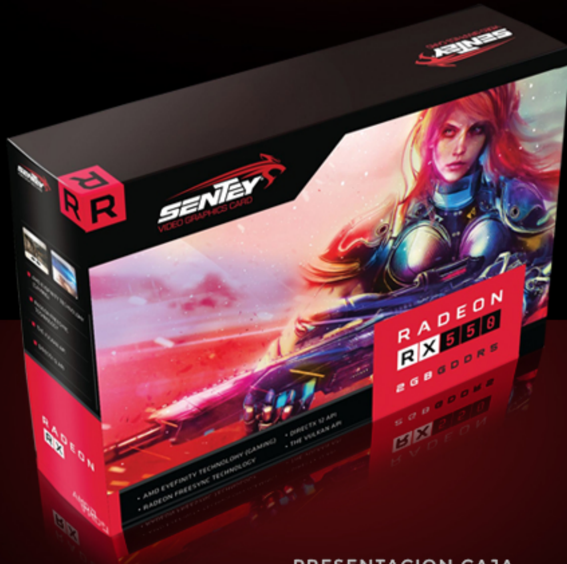
PRESENTACION CAJA 690*420*300MM